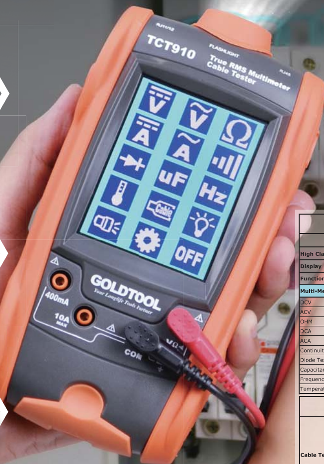
Detail Specification of (TCT-910) (Multi-Meter)