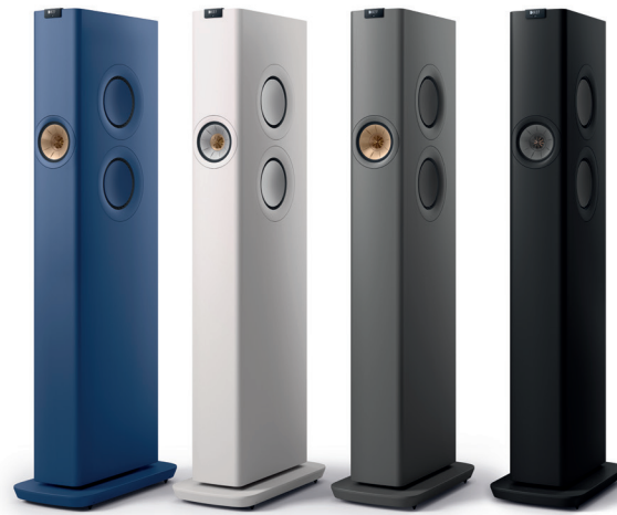
Royal Blue Mineral White Titanium Grey Carbon Black